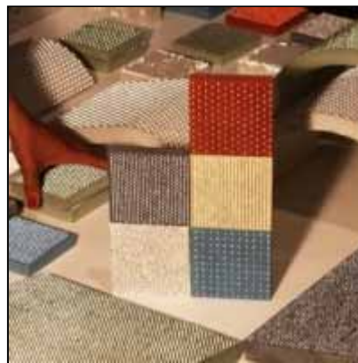
Blingcrete Color in a variety of vibrant colors, and also in grayscale from white to anthracite.