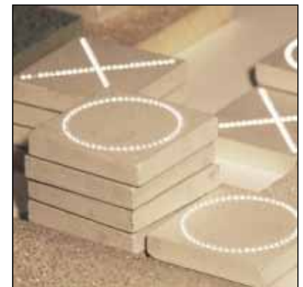
Blingcrete Crème + Writing shapes are plane, angular, and rounded with graphic symbols.

Our readers are encouraged to submit their experiences with these types of products for publication in future issues.