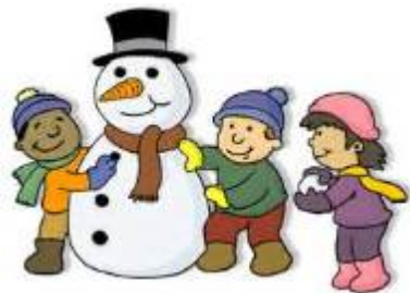
FROSTY IS BACK