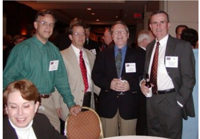
NOVA Chapter members at 2002 Middle Atlantinc Conference in Reston, VA